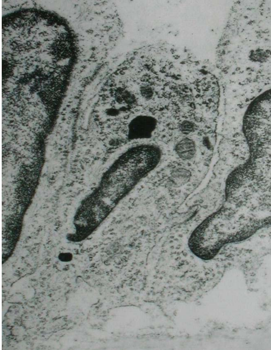
FIGURE 2. ELECTRON MICROGRAPH OF SCORBUTIC GUINEA-PIG AORTIC ENDOTHELIUM. Note the widened intercellular junction gaps. From Gore et al [11]. With permission from the American Medical Association.

in man. This can be achieved simply by vitamin C supplementation.