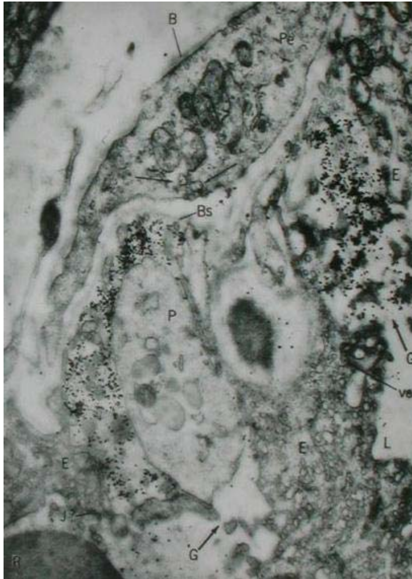
FIGURE 3. ELECTRON MICROGRAPH OF THE WALL OF A LEAKING RAT BLOOD VESSEL, 2½ MINUTES AFTER LOCAL INJECTION OF HISTAMINE AND I.V. INJECTION OF HGS, WHICH WAS USED AS A MARKER. Endothelial gaps are seen (G,G). Tracer particles, chilomicra and a platelet (P) have penetrated into the wall of the vessel. Bs, septum arising from the basement membrane; Pe, pericyte; E, endothelial cell; L, vascular lumen; B, basement membrane; R, red blood cell; ve, a lone tracer particle within an endothelial cell; J?, intercellular junctions. From Majno and Palade [12]. With permission from the Rockefeller Institute Press.

A review of the literature on this subject [18] has shown that vitamin C also protects against four varieties of gas gangrene and against tetanus clostridia toxins. This was observed even in rats and mice, which synthesize their own ascorbic acid from simple sugars in the liver. Clearly, these animals do