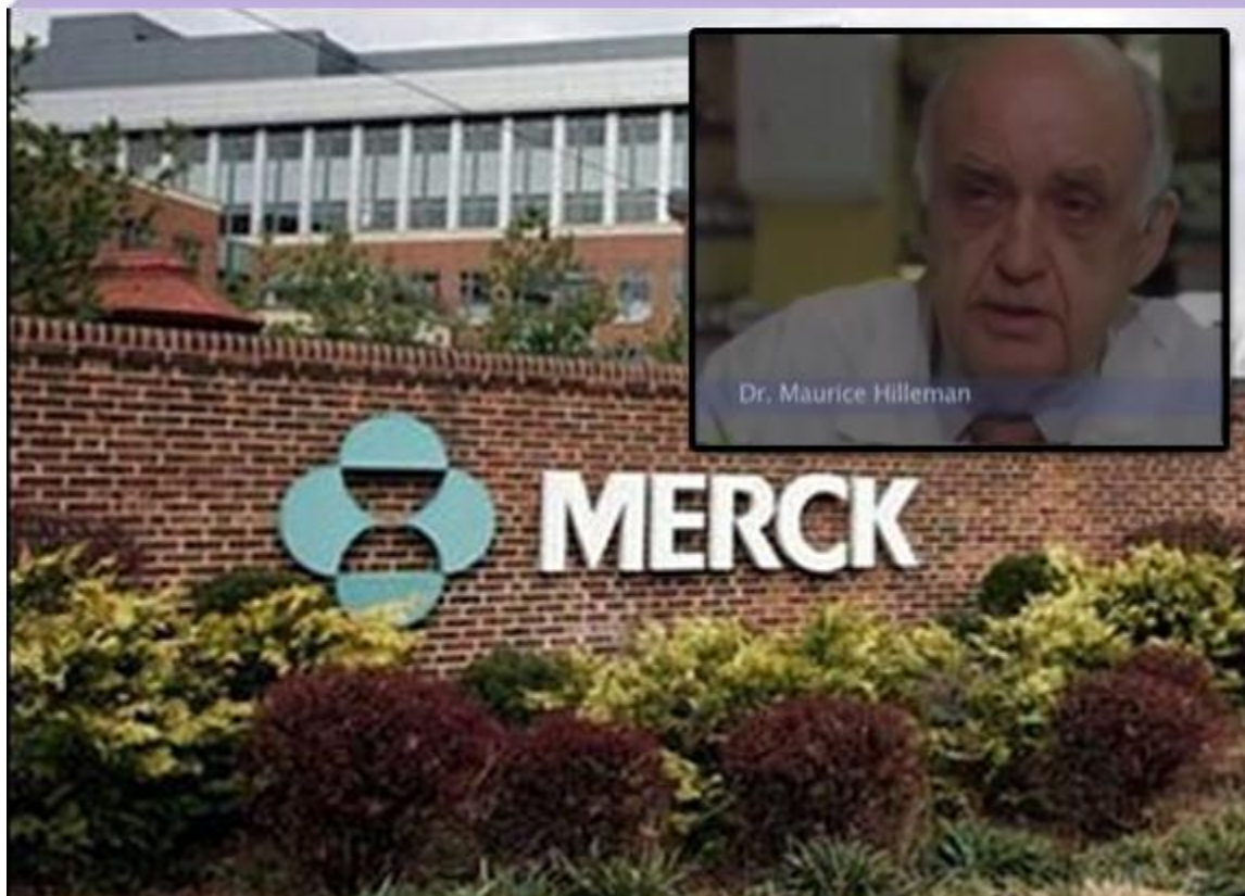
Dr. Maurice Hilleman